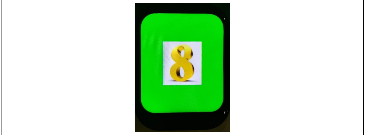
Figure 3. Display pictures