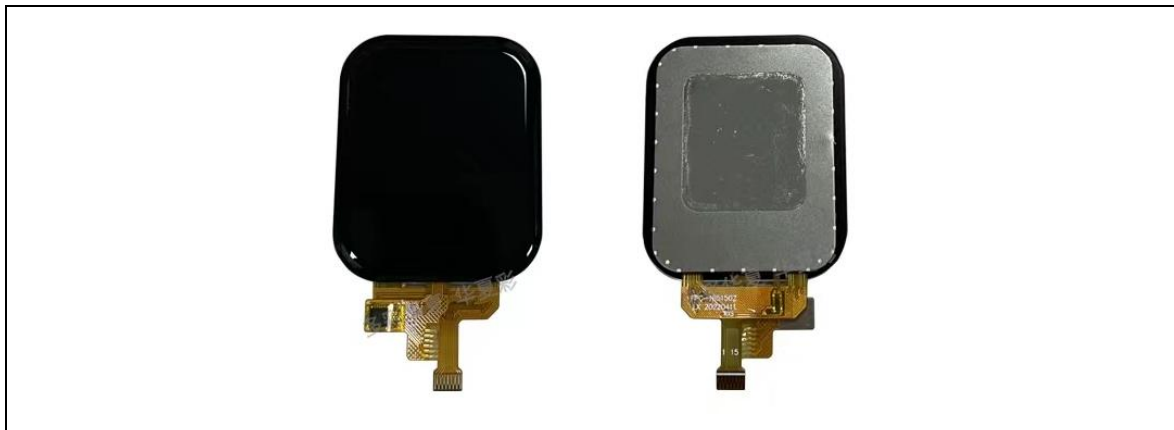
Figure 2. Touch screen